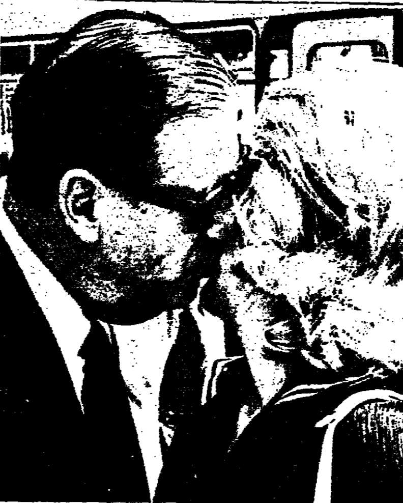
Foreign Minister Eban kisses his wife good-bye on the tarmac yesterday before boarding an El Al bus to the aircraft.